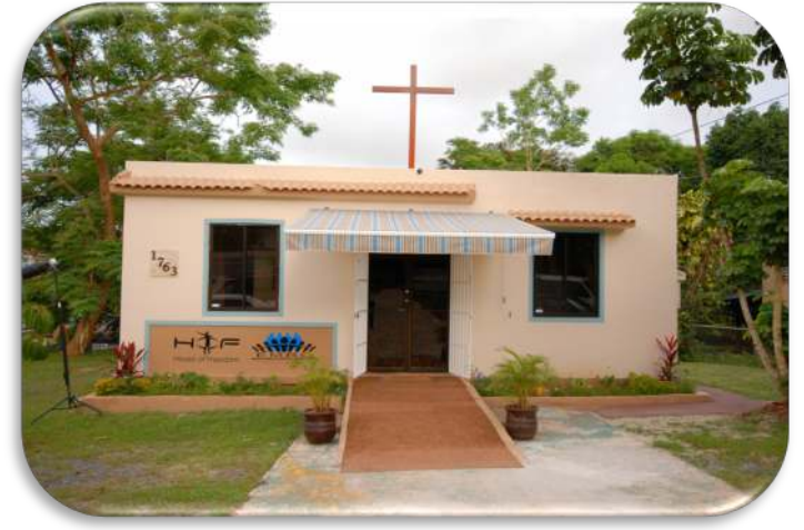
Puerto Rico Facilities